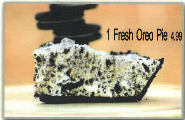
1 Fresh Oreo Pie 4.99